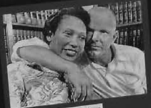
Paul and Mildred Loving

"There can be no doubt that restricting the freedom to marry solely because of racial classification, violates the central meaning of the equal protection clause of the Fourteenth Amendment... To deny this fundamental freedom on so invidious a basis as the race of the citizens of the state is surely to deprive all of the state's citizens of liberty without due process of law." -Chief Justice Earl Warren